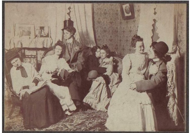
Picture 3: thankfully the chaperone falls asleep, and the couples get to do a little "spooning".